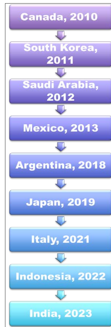
Fig 1: The table below shows Countries in chronological order

Parliamentary Speakers' Consultations, launched first by Canada in 2010 and followed by South Korea in 2011.